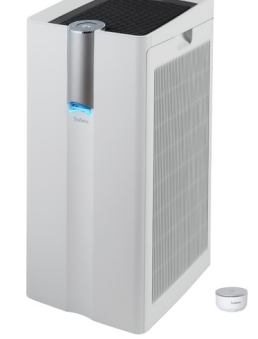
TruSens Performance Series Air Purifier Z7000AP