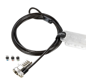
Kensington Universal 3-in-1 Keyed Laptop Lock K62318WW